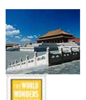
Beijing & Great Wall Overland Adventure (Double)

Tour does not operate on Tuesdays or public holidays.